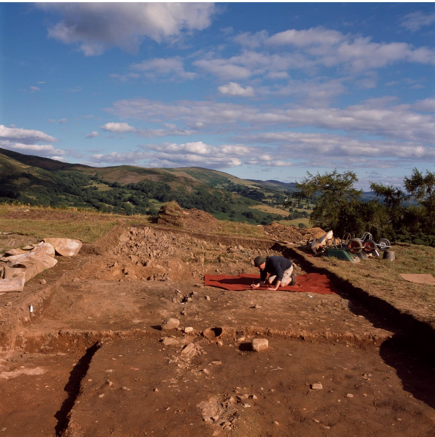
Simon Callery trabajando en el sitio arqueológico de Moel y Gaer, Bodfari en 2015.