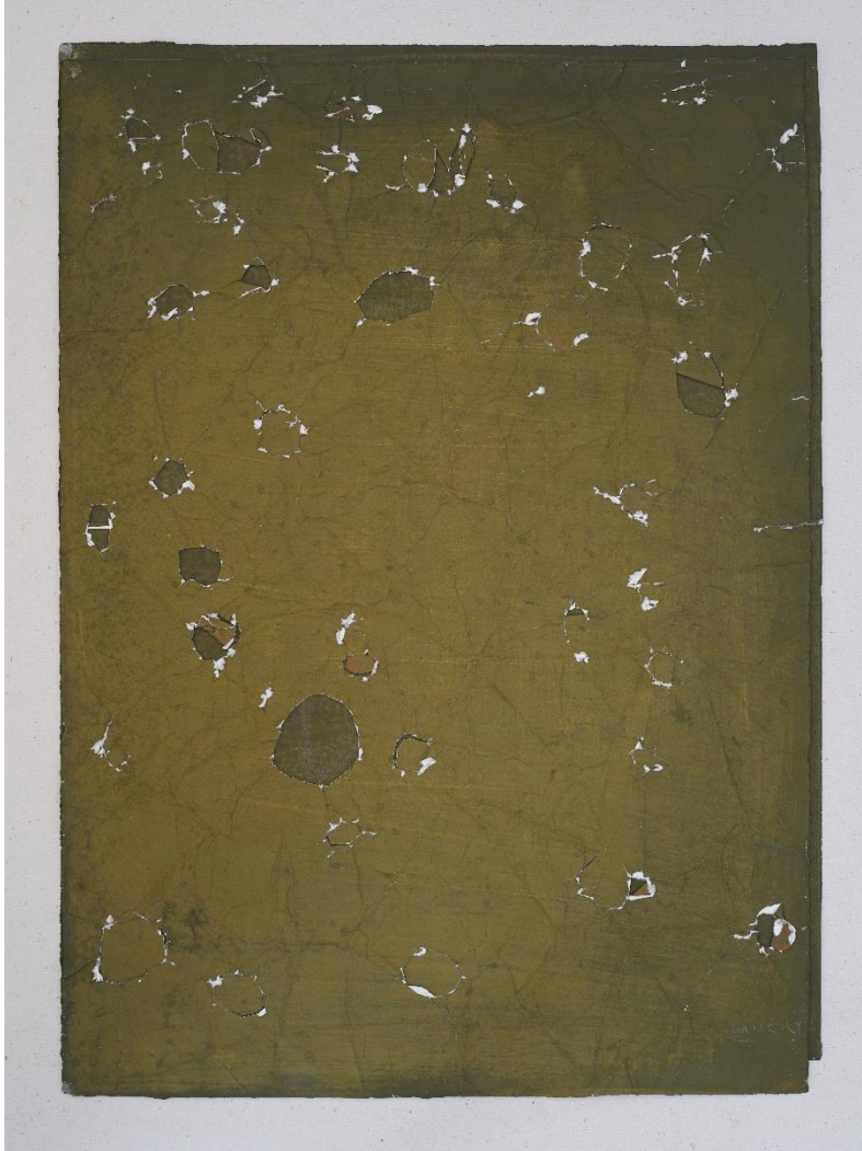
Contact Drawing Bodfari B, 2019 Pintura al temple y lápiz sobre papel 53,5 x 39,1 cm