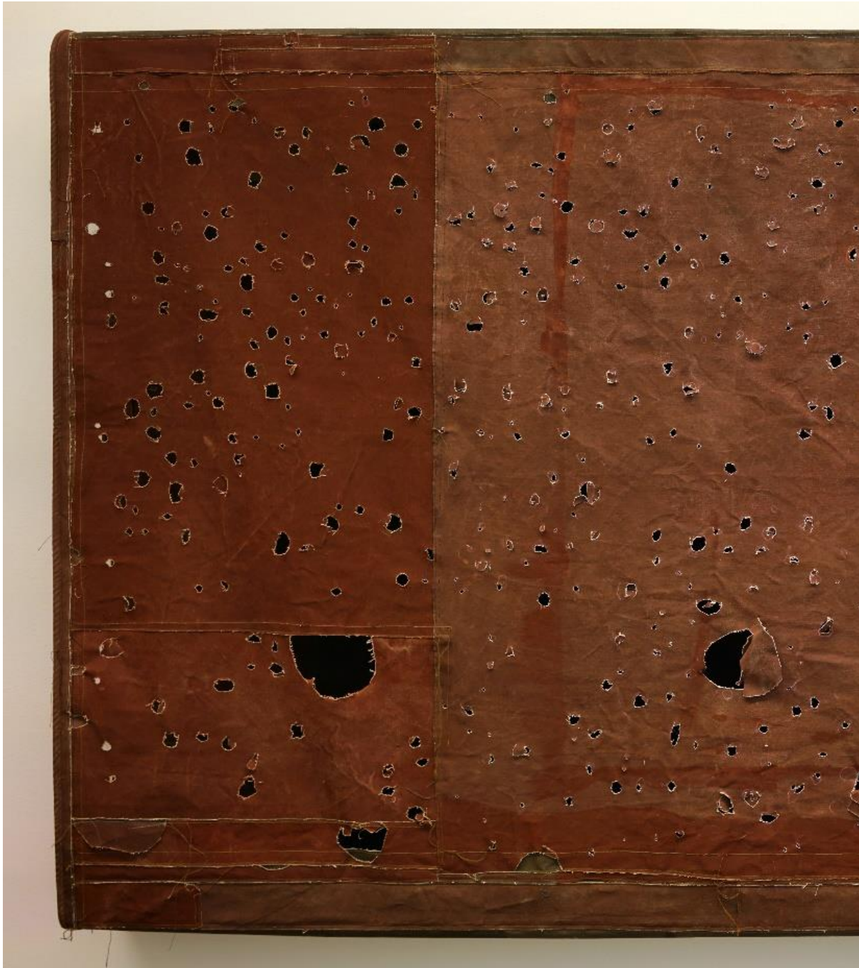
Nesscliffe Horizontal, 2021 Tela, pintura al temple, hilo y madera 146 x 260,5 x 23 cm