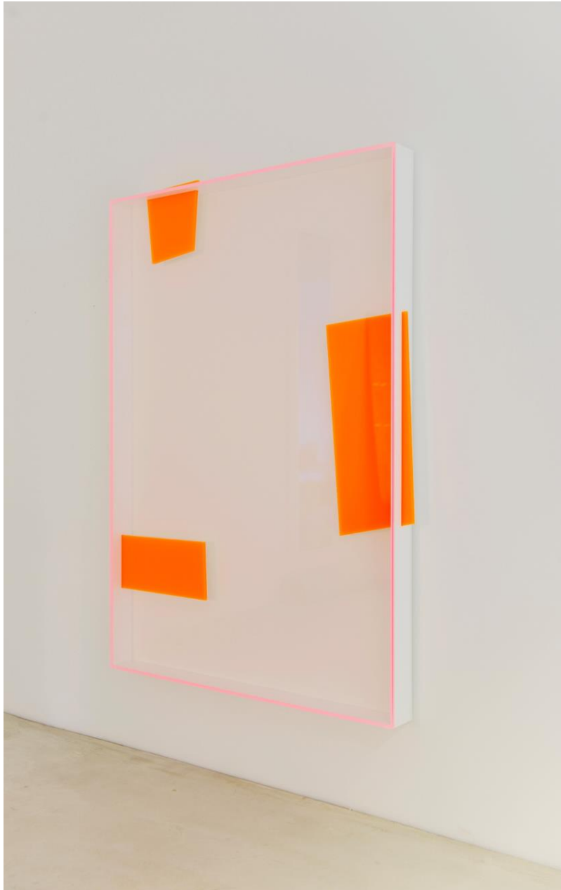
Regine Schumann Colormirror glowing after satin orange paris, 2022 Acrylic glass fluorescent 160 x 112,7 x 10 cm