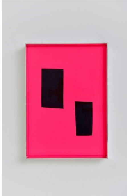
Regine Schumann fluo cut #68, 2022 Mixed media 29 x 21 cm