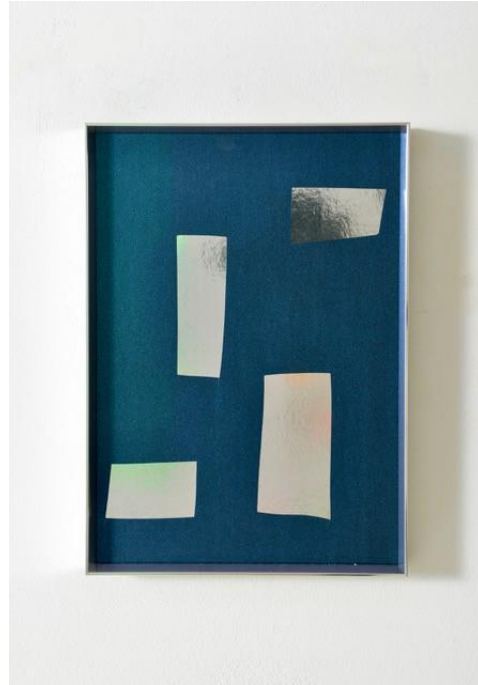
Regine Schumann fluo cut #64, 2021 Mixed media 29 x 21 cm