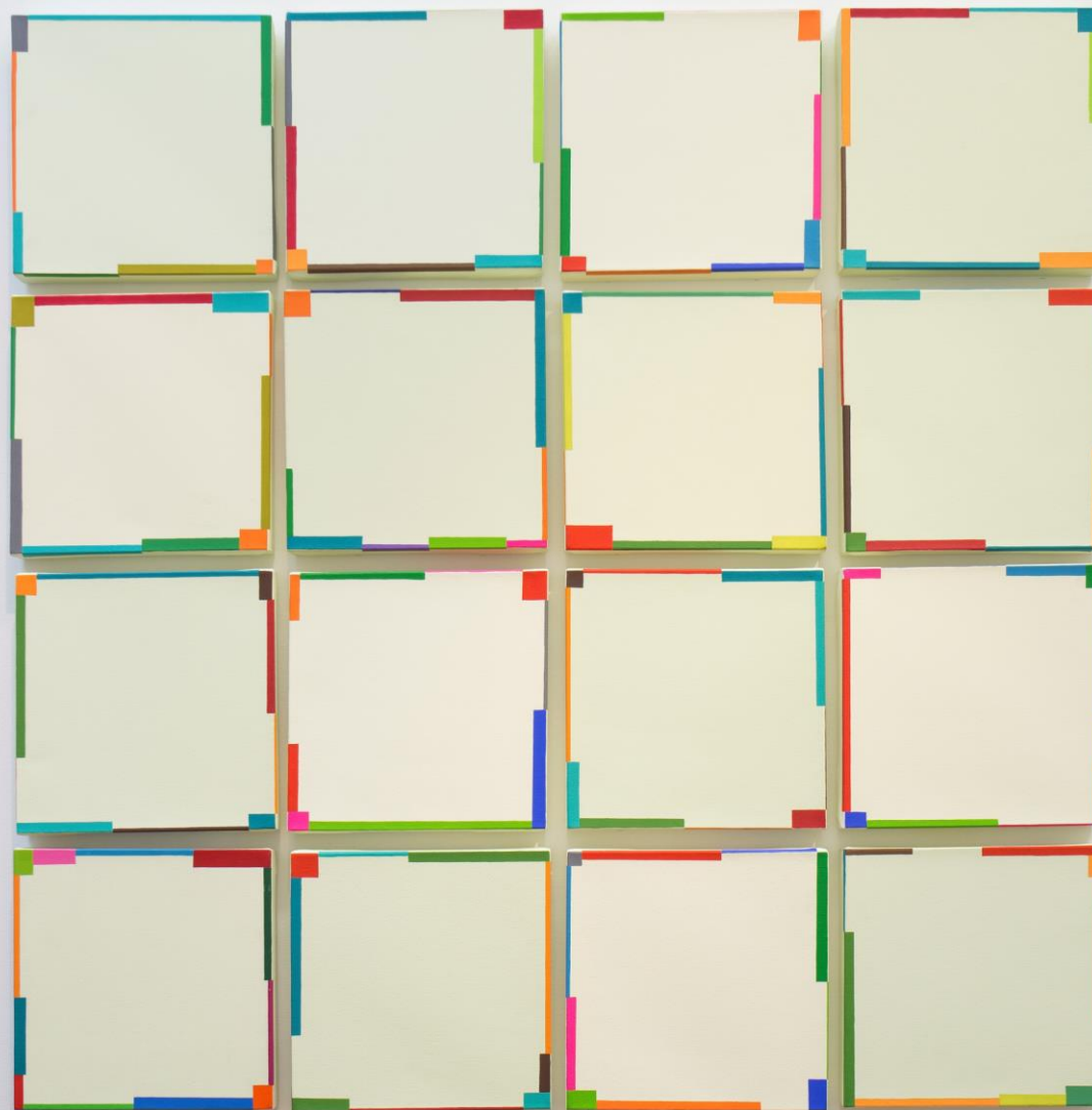
Beatriz Olano Cuadrado , 2016 Acrylic on canvas 150 x 150 cm