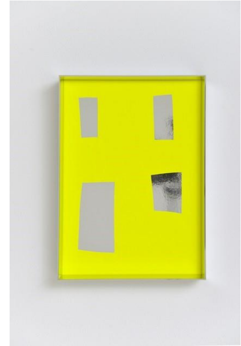
Regine Schumann fluo cut #67, 2022 Mixed media 29 x 21 cm